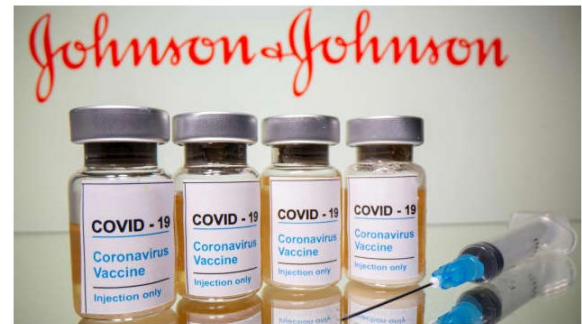
Johnson & Johnson Coronavirus vaccine illustration